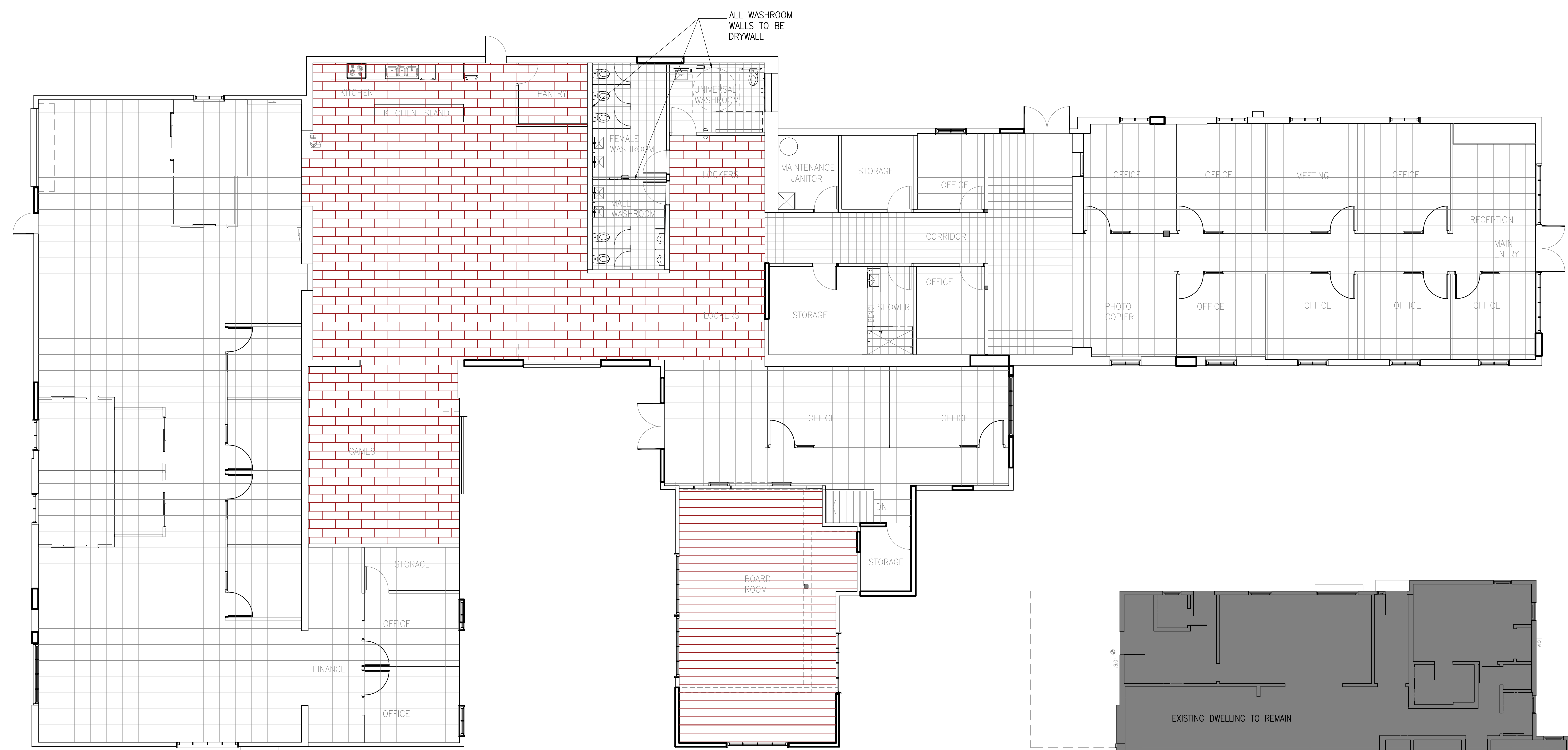
1 FINISHED FLOOR PLAN SCALE:1:100