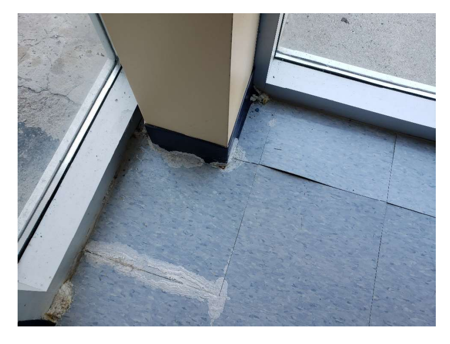
Photograph 4: Water-damaged non-asbestos vinyl floor tiles and drywall.