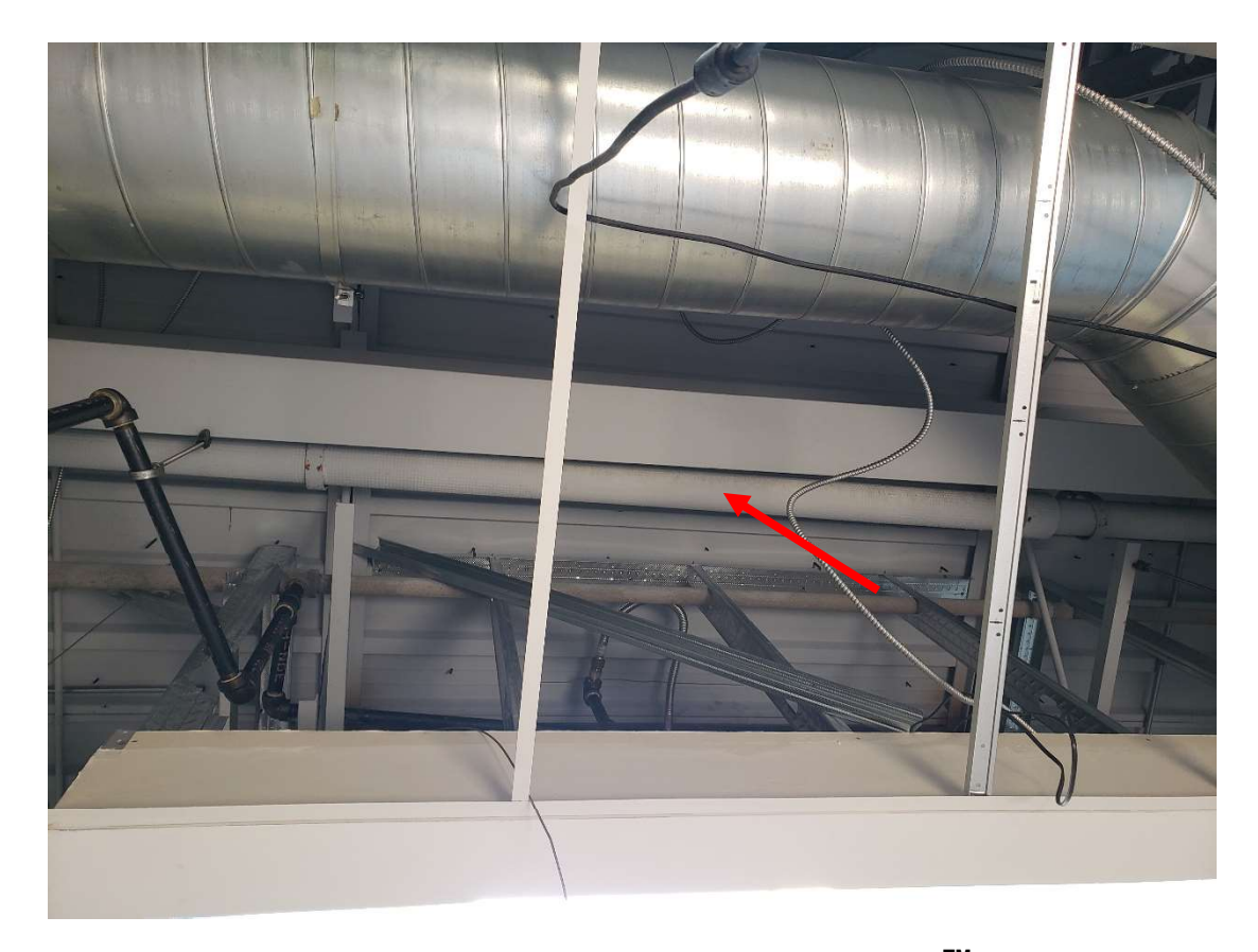
Photograph 6: Asbestos-cement (also known by the tradename Transite<sup>™</sup>) observed in the traversing ceiling space throughout the Unit.