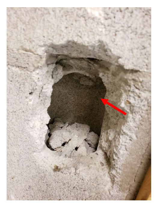
Photograph 2: Where observed, no vermiculite present within concrete block walls.