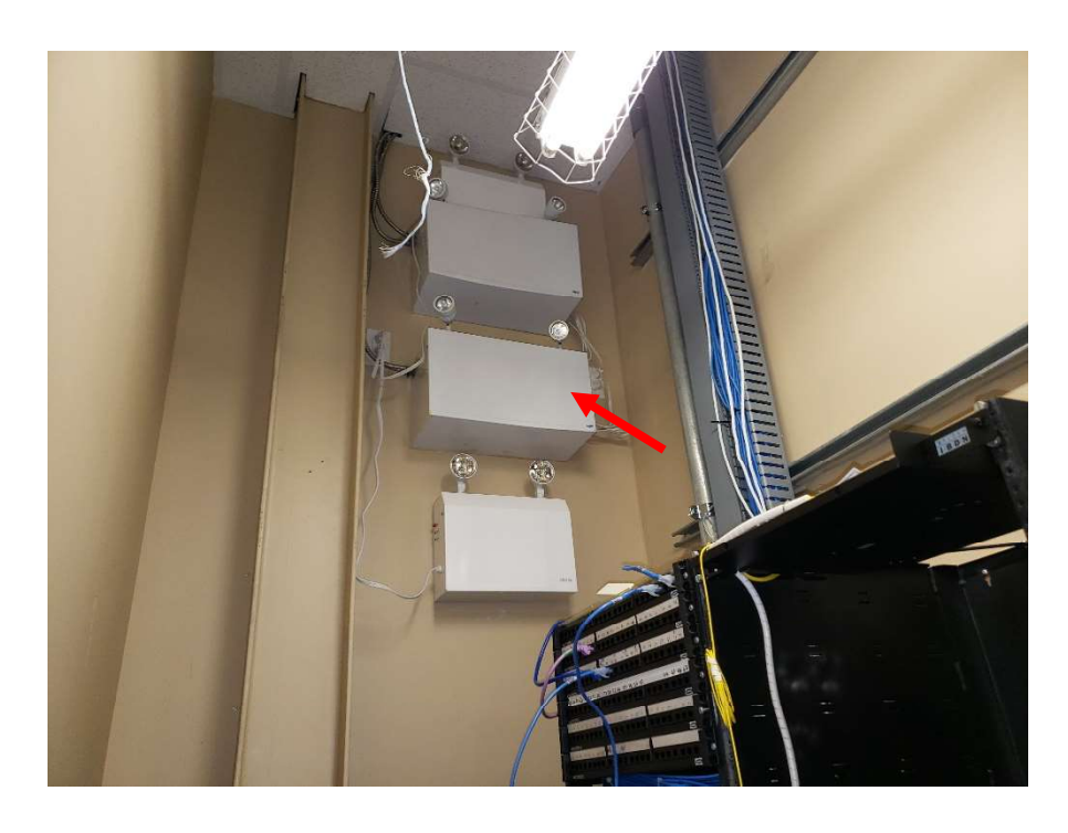
Photograph 3: Presumed lead-containing batteries within emergency lighting.