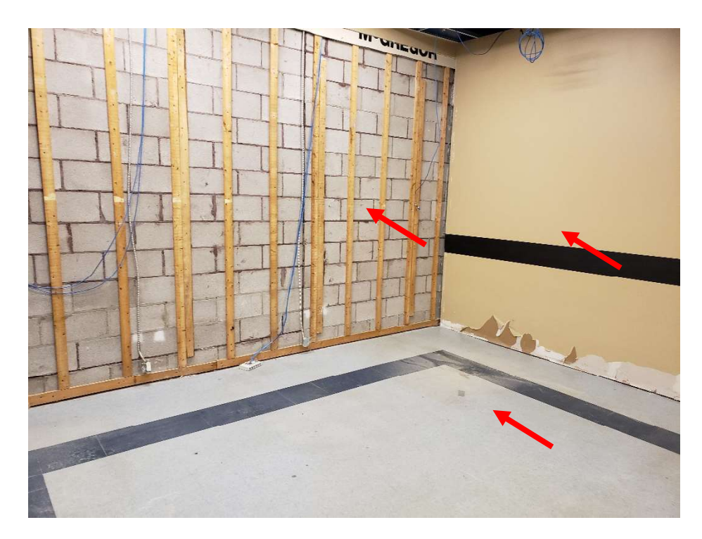
Photograph 1: Non-asbestos various 12"x12" vinyl floor tiles, drywall joint compound, and concrete brick mortar within former Classrooms, throughout Unit.